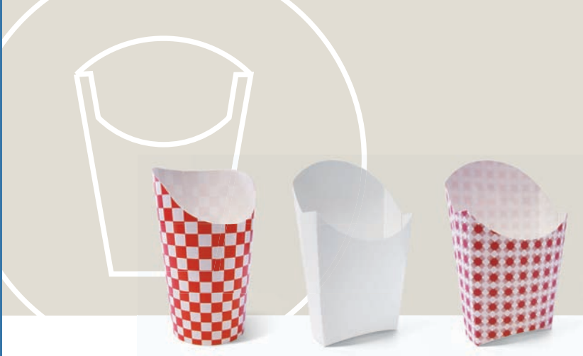
Finger Food Scoop